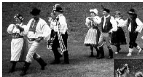
Folk dancers performed at the Czech and Slovak embassies

U.S. Navy band performs at Masaryk dedication