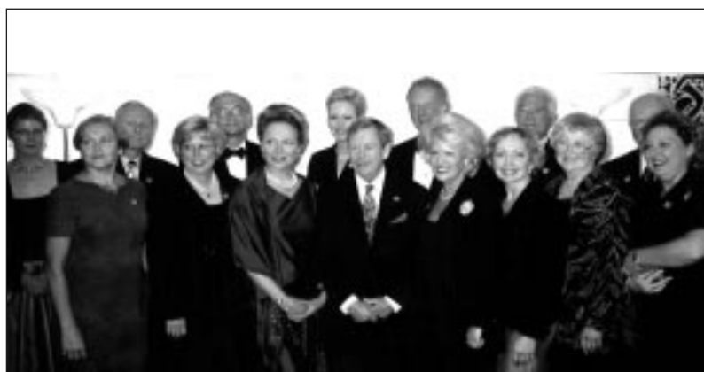
Honorary consuls from across the U.S. meet with President Havel